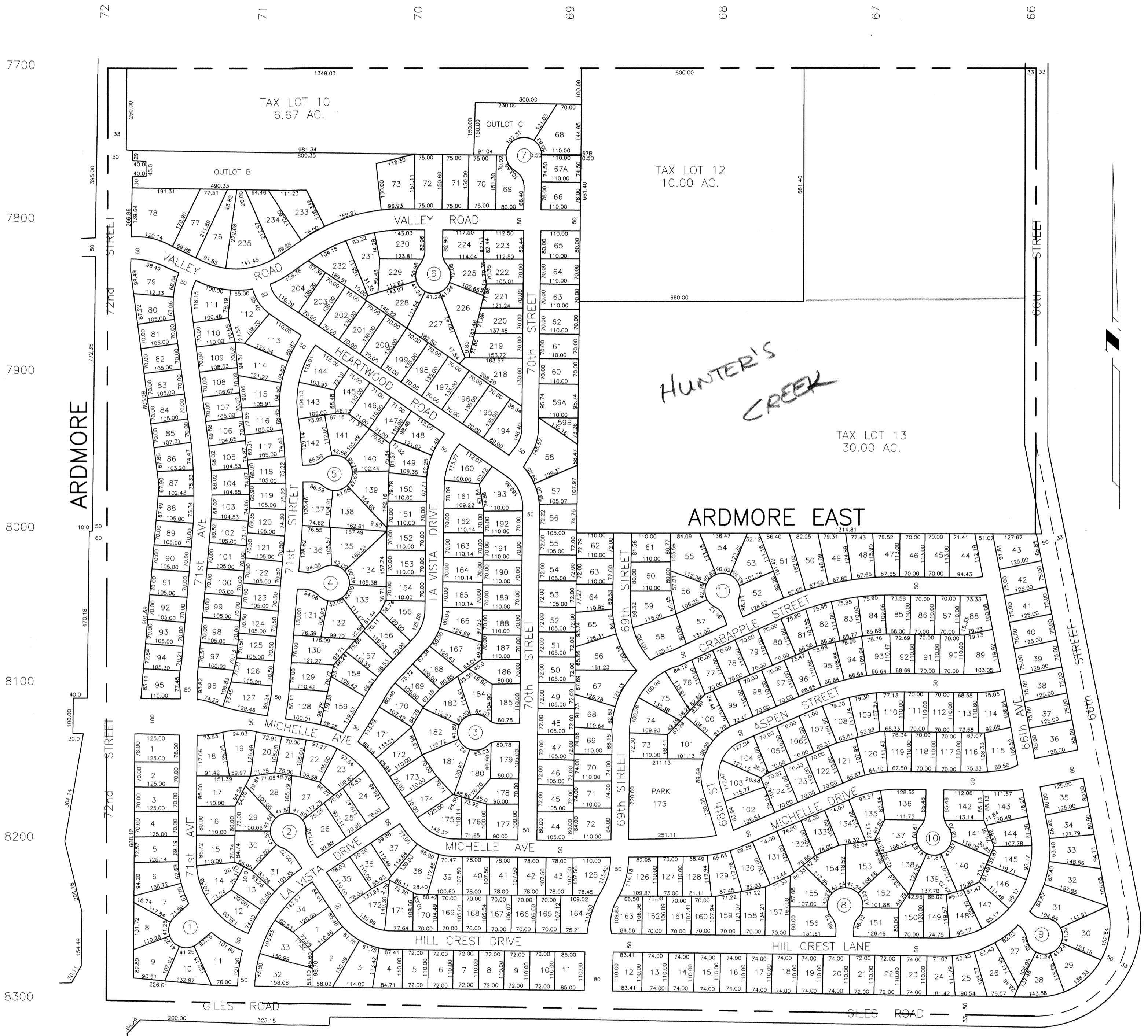
ARDMORE REPLAT LOTS 218 THRU 235