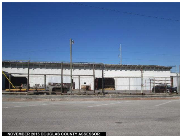
NOVEMBER 2015 DOUGLAS COUNTY ASSESSOR