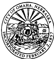
City of Omaha Jean Stothert, Mayor

Omaha/Douglas Civic Center 1819 Farnam Street, Suite 1003 Omaha, Nebraska 68183 (402) 444-5150 Telefax (402) 546-0714