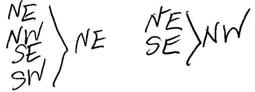
EXHIBIT A LEGAL DESCRIPTION

The Northeast Quarter (NE \frac{1}{4} ) and the East Half of the Northwest Quarter (E \frac{1}{2} NW \frac{1}{4} ) of Section 26, Township 15 North, Range 11 East of the 6th P.M., in Douglas County, Nebraska, subject to public roads and/or highways, and, EXCEPT that part thereof more particularly described as follows: